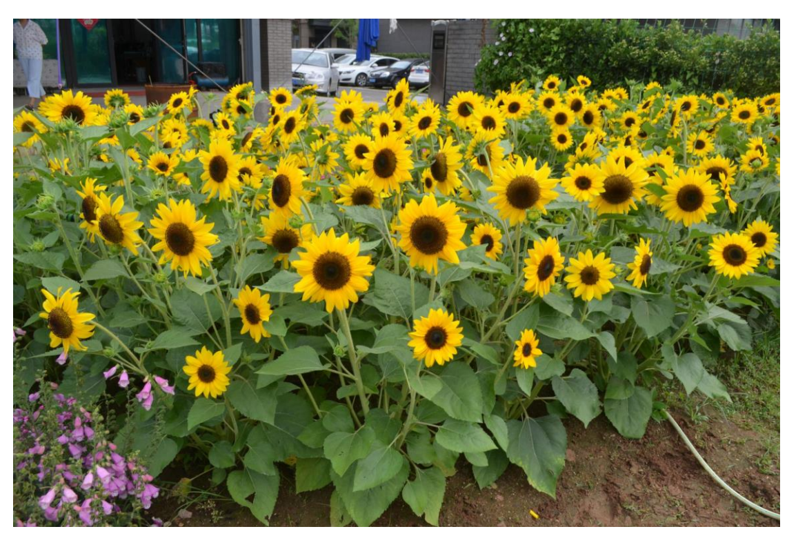
Pictured 28 days after pinching, 56 days after sowing

Pinched after 4 weeks (end of May, keeping 10-12 leaves)