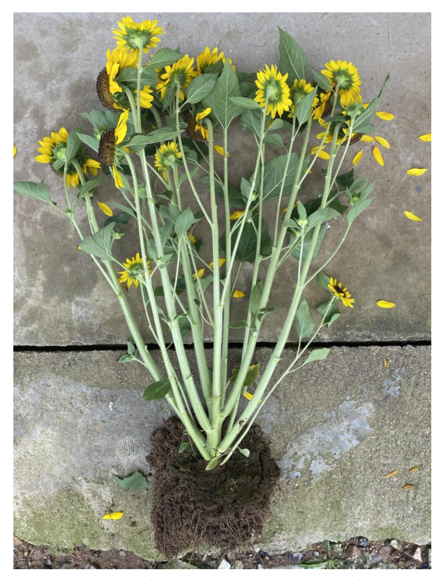
Pictured 40 days after pinching, 68 days after sowing